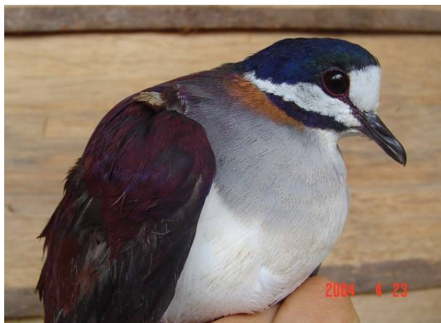
Figure 1. G. purpurata (RNA Pangan, Nariño, Colombia; J. C. Luna/ProAves).

We are not aware of any published paper concerning vocal variation in this species. Remsen et al. (2012) considered this split but decided against adopting it on account of the lack of published analysis of vocal variation. Only Ridgely & Greenfield (2001)'s transcriptions were available in addition to some published and archived recordings at that time. Given that other authorities continue to split these birds, that several sound recordings are now available of both populations and the results of recent molecular studies, a re-evaluation of the available vocal data is called for.