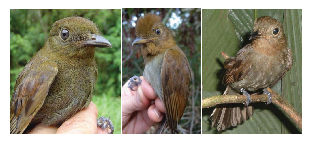
Figure 2. The three species found in Colombia. <u>Left</u>: Brown Schiffornis S. veraepacis group (subspecies buckleyi / rosenbergi ). RNA El Pangan, Nariño, Colombia. (locality of recording in Figure 3H). <u>Middle</u>: Slender– billed Schiffornis S. stenorhyncha . Santa Cecilia, Bolivar, Colombia (locality of recording in Figure 3M). <u>Right</u>: Thrush–like Shiffornis S. turdina amazonum Caparu, Amazonas.