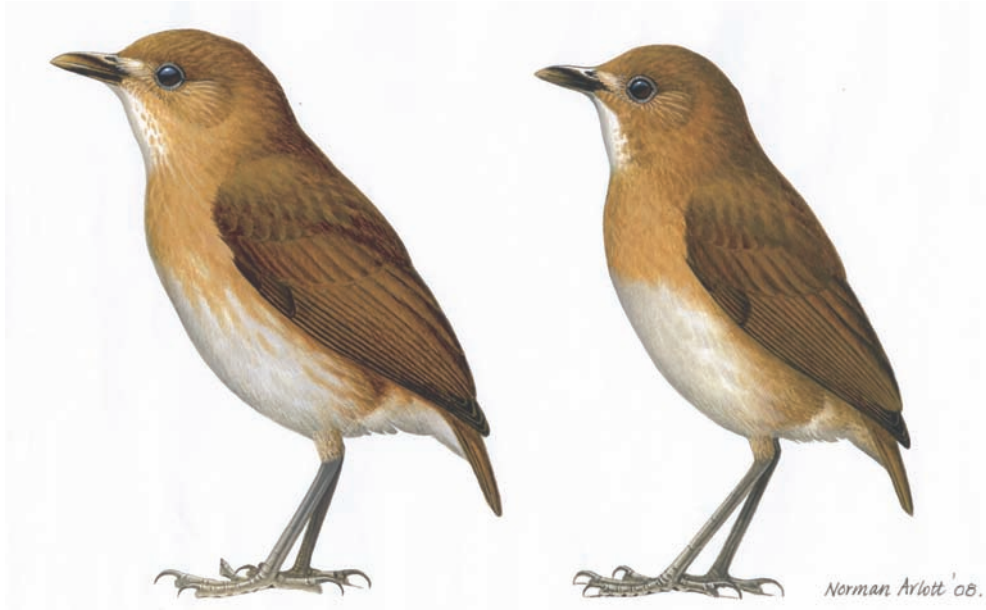
Figure 1. Plate by Norman Arlott showing Grallaria m. gilesi (left) and Grallaria m. milleri (right).