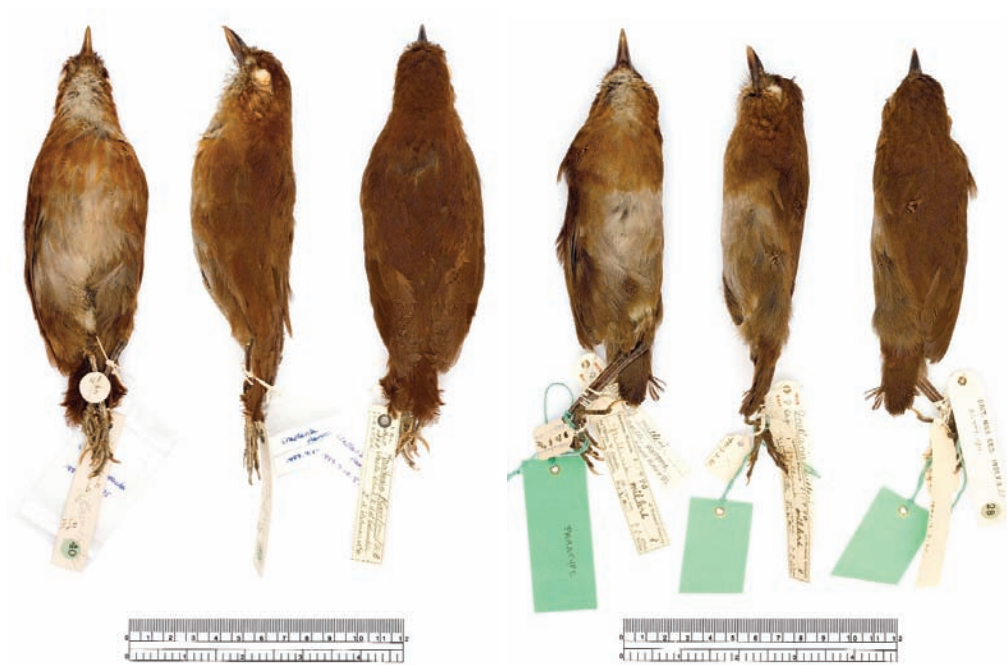
Figure 2. The Grallaria m. gilesi holotype (left three images) and Grallaria m. milleri paratype (right three images).