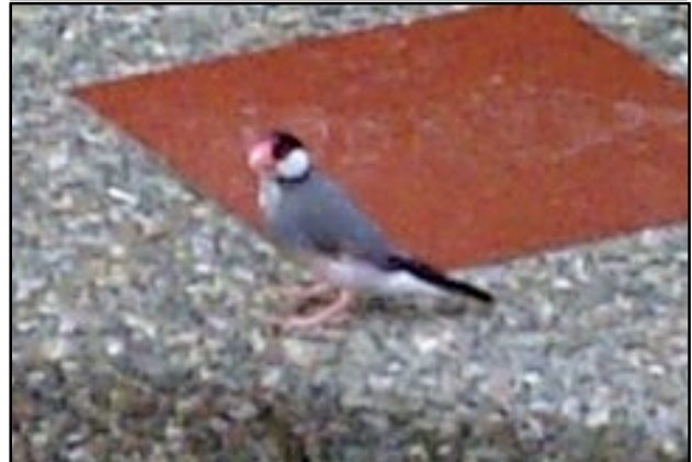
Figures 1 a-d. Java Sparrow Padda oryzivora Las Camelias, Quindío, Colombia, 14 December 2012.